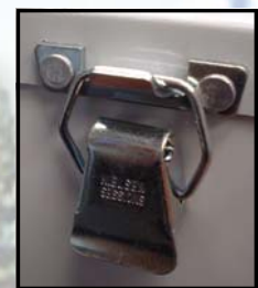
OPTIONAL LID LATCH