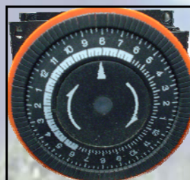
OPTIONAL 30MIN, 2, 12 AND 24 HR TIMERS